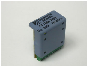
Forward Equalizers 74100