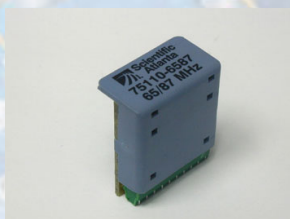
Diplex Filters 75110 Amplifiers Only